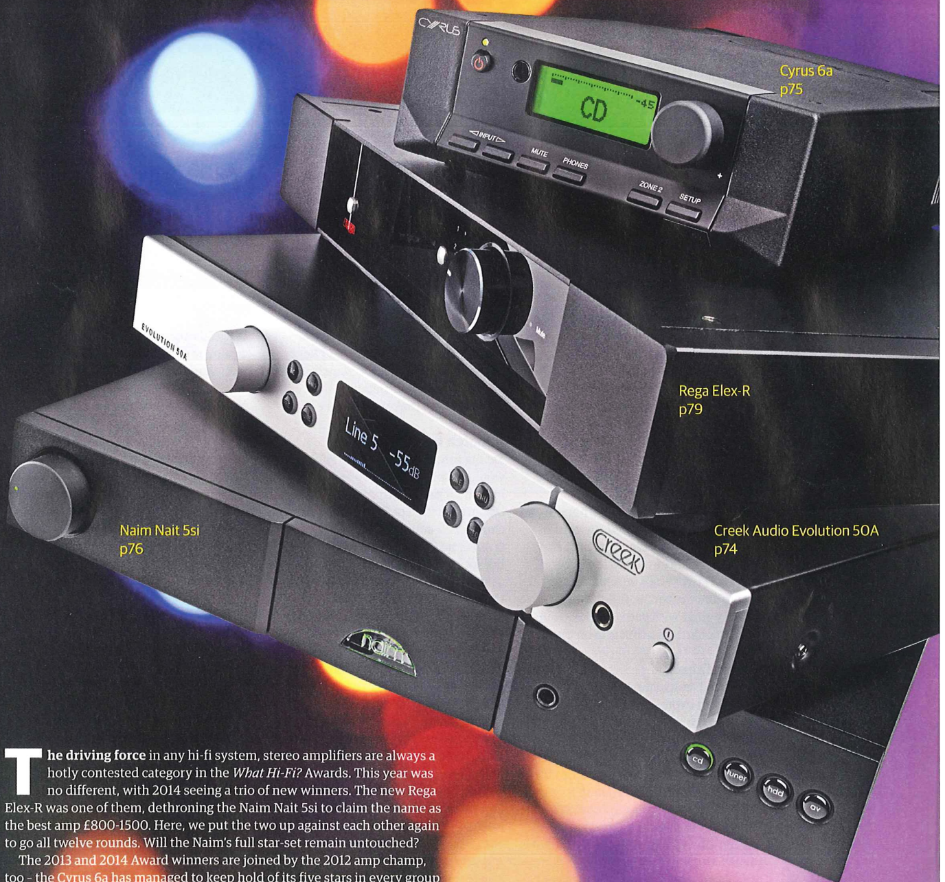
Cyrus 6a p75

Listen to our favourite tracks every month!